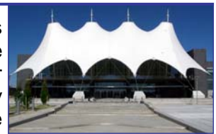
Hampton Roads Convention Center